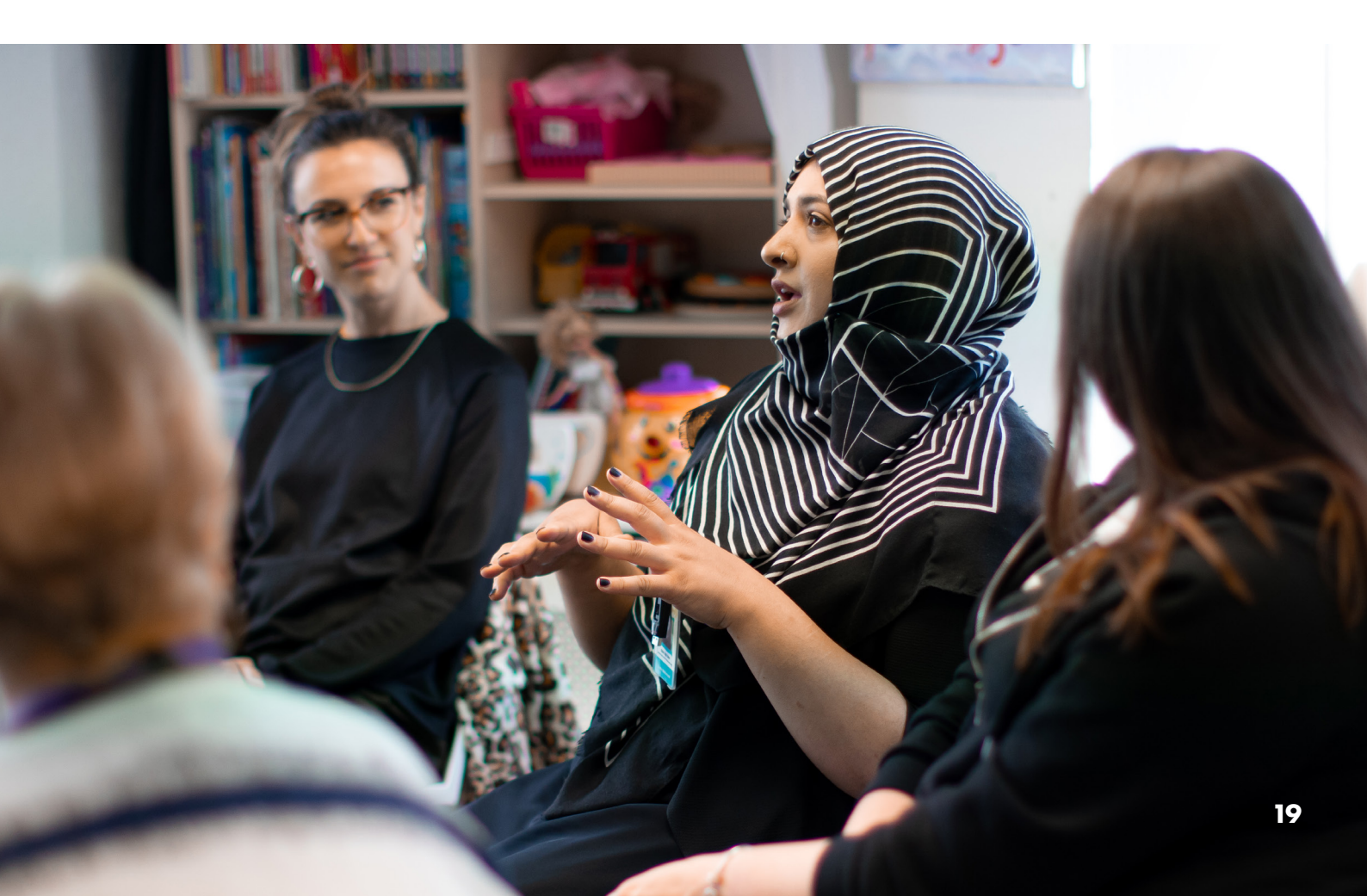
30. Our research based on interviews with young women with lived experience shows that they value "safe, girl-only environments that are run by gender-specialist services with expertise surrounding the challenges faced by young women with intersecting and marginalised identities, including for Black, Asian, and minoritised and/or LBTQ+ young women." For an overview, see p.49, Agenda Alliance (2022) Pushed Out, Left Out

Specialist services provide young women with activities which support their development by adopting strengths-based approaches and providing practical and therapeutic support. Young women tell us that they want access to safe spaces for activities that recognise their skills, strengths, and capacity for joy, despite the hardships they may have faced. Specialist "by-and-for" services that support Black, Asian, minoritised, and migratised women are both effective in delivering the right support and particularly valued by the girls and women with whom they work.<sup>30</sup> These services cultivate relationships of trust between women and practitioners, who bring an understanding of the lived experience and social realities of the lives of those who are racially minoritised.